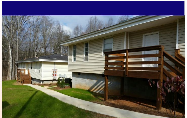
Jeremiah's Place, Units 3 and 4

Finally, a host of volunteers contributed to improving the aesthetics of Jeremiah's Place. A group from Dahlonga United Methodist Church supplied planted flowers around the office area and painted the foundations of the units. Students from Lakewood Baptist Church stained picnic tables, and students from the University of North Georgia stained the decks for all the units.