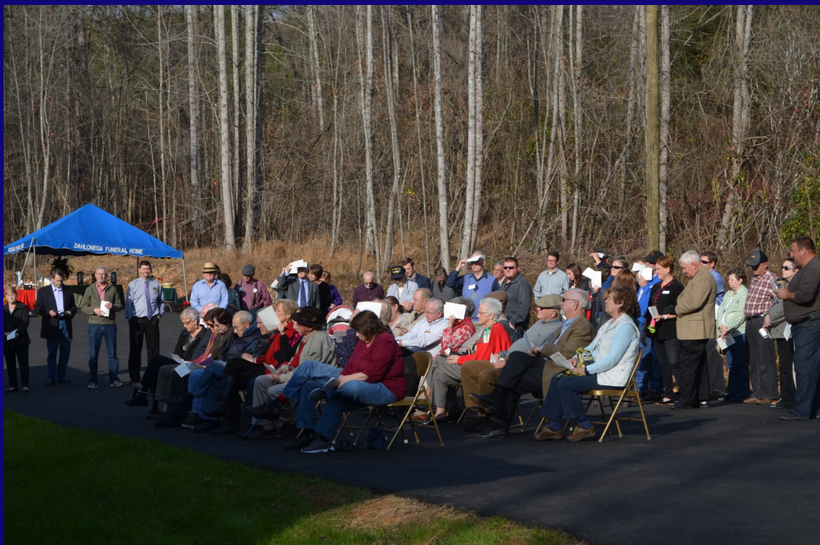
Dedication of Jeremiah's Place, December, 2015

“For I know the plans I have for you,” declares the Lord, “plans to prosper you and not to harm you, plans to give you hope and a future.” Jeremiah 29:11