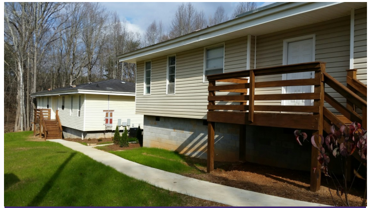
Jeremiah's Place, Units 3 and 4

We have been fortunate to have few major maintenance issues at the property, and the generosity of volunteers and local businesses to maintain a safe environment for our families.