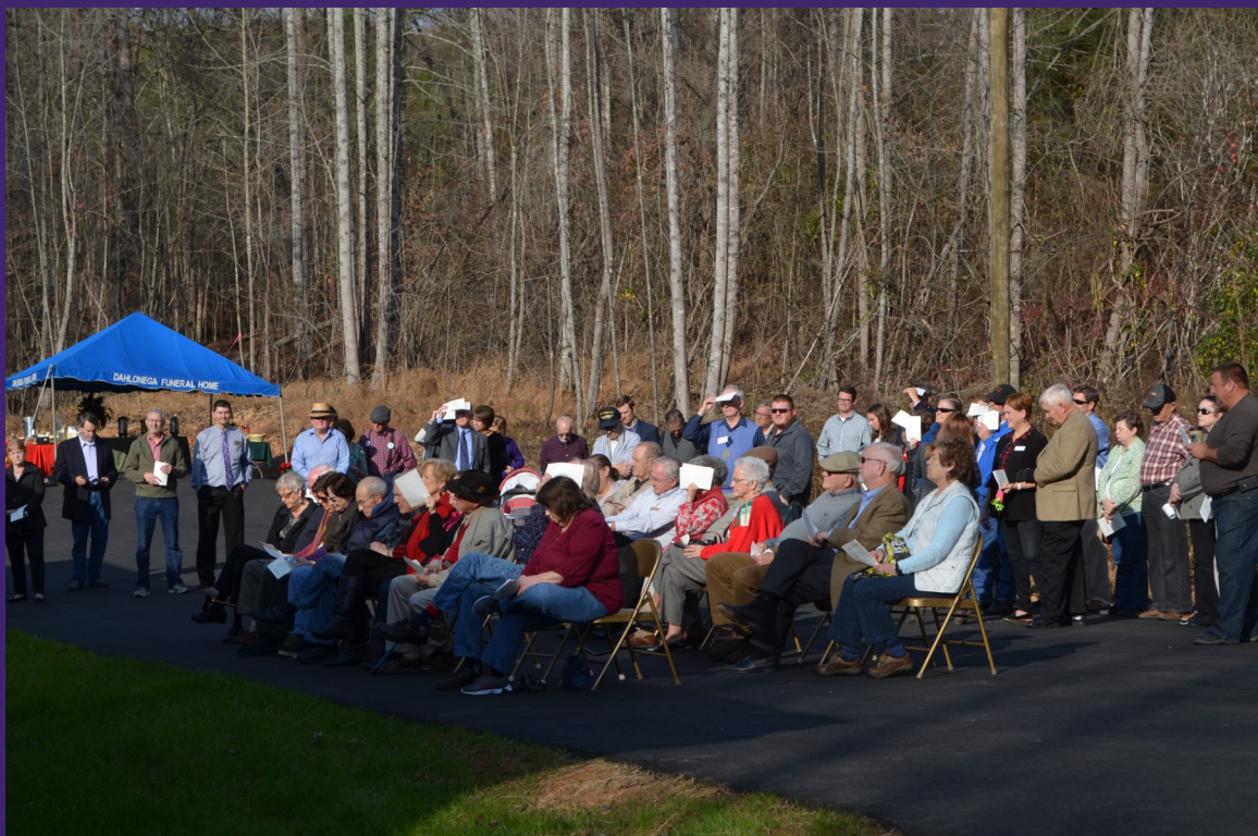
Dedication of Jeremiah's Place, December, 2015

“For I know the plans I have for you,” declares the Lord, “plans to prosper you and not to harm you, plans to give you hope and a future.” Jeremiah 29:11