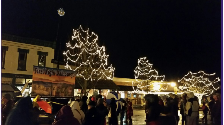
First Night Dahlonega Fundraiser

Enough funds are held in reserve to support a year of operating expenses.