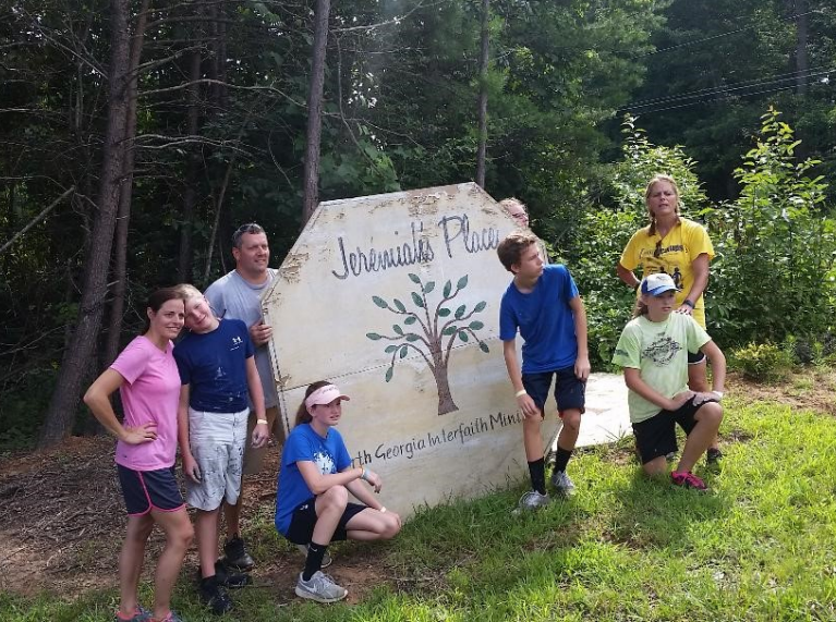
Volunteer Work Day