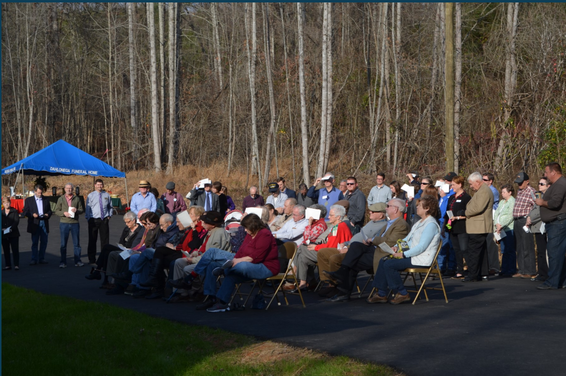
Dedication of Jeremiah's Place, December, 2015