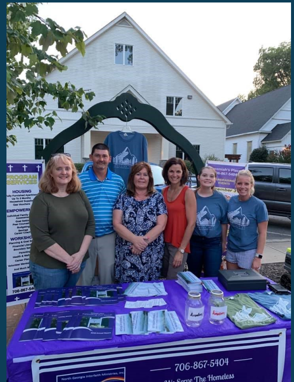
Movies In The Park