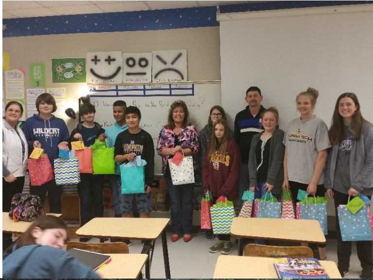
Presentation at Lumpkin County Middle School