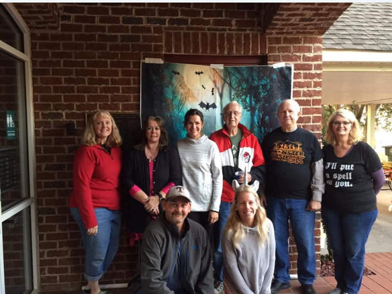
Monster Dash 5k Fun Run