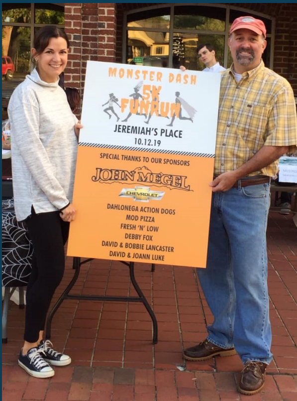
Thank you Mr. Mayor for being the "MC" at our Monster Dash 5k Fun Run