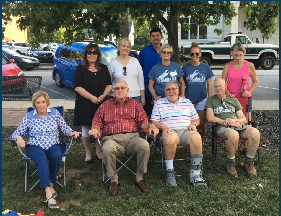
Movies In The Park

www.lumpkincountyhomeless.org 706-867-5404 lumpkincountyhomeless@gmail.com